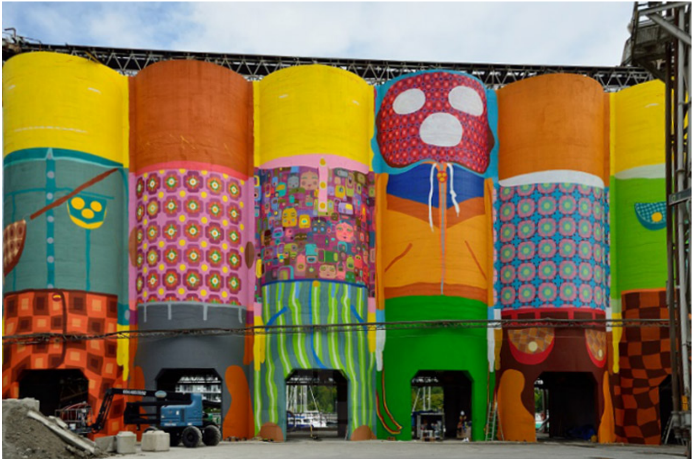
six industrial silos get a complete make-over by the brazilian artists

os gemeos takes their ongoing 'giants' project to canada, transforming six industrial silos with their bold mural painting for the vancouver biennale . sited on granville island, the brazilian brotherly duo are renewing the industrial landmark, which is home of the ocean cement manufacturing and distribution plant, into an enormous public art work that spans 360-degrees of the 23-meter (75 foot) tall cylindrical forms . in its completion the mural will measure a total of 7200 square meters (23,500 square feet) - their largest opus to date - bringing renewed life to the locale, positioned alongside the world-famous public market, emily carr university and boat docks that attracts 10.5 million visitors per year.