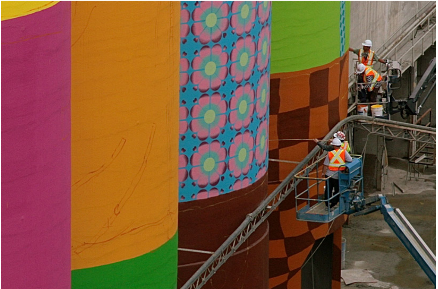
bit by bit the cylindrical towers are transforming into an enormous public art work

connection with sculpture, we decided to find a place where the painting can be transformed, creating a dialogue between the two-dimensional and three-dimensional worlds. another aim of this project is to bring new characters to vancouver while sharing perspectives and cultures and establishing a relationship between the people who frequent this site and integrate this work into the city scenery. the connection between water and land on granville island, on the false creek margins, also had a lot to do with the choice of location - for us, the water acts as a vein, symbolizing life, and it is very present in our work.'