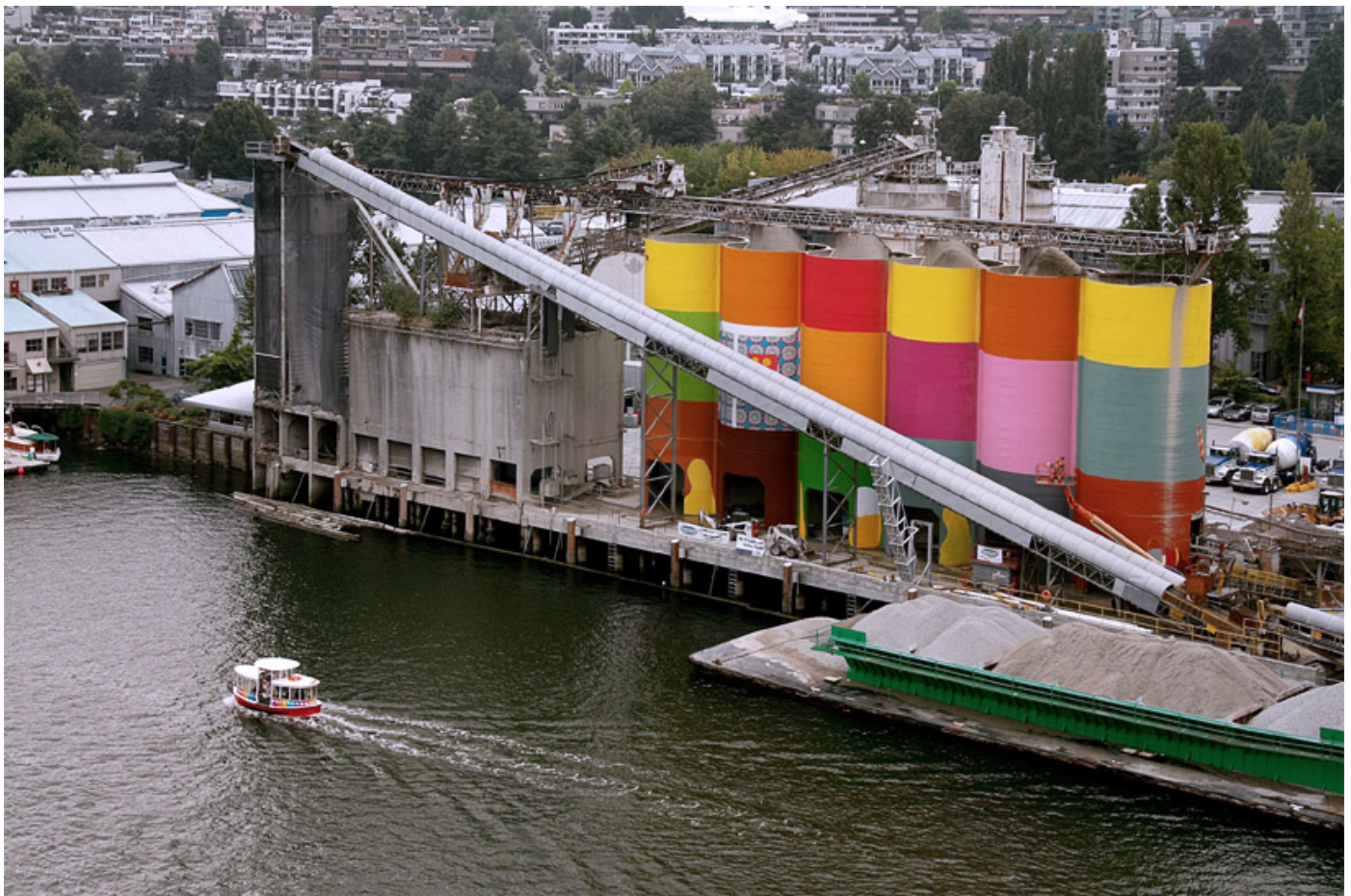
view of the site