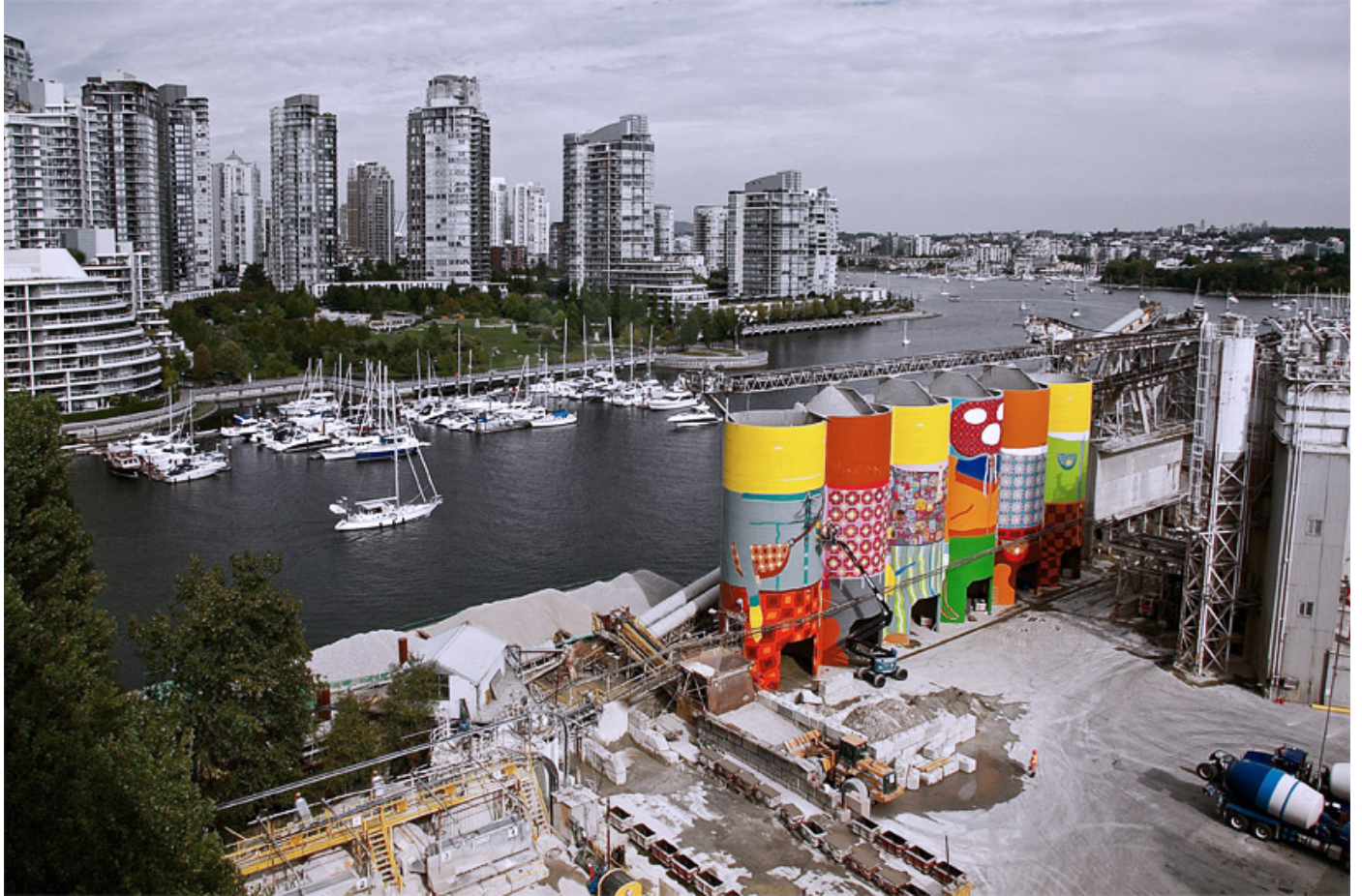
aerial view of the site