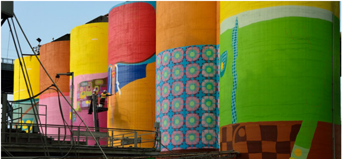
in its completion the mural will measure 7200 square meters (23,500 square feet)