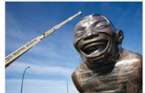
Yue Minjun's A-maze-ing Laughter gets put in place at the start of the 2009-2011 Vancouver Biennale exhibit.