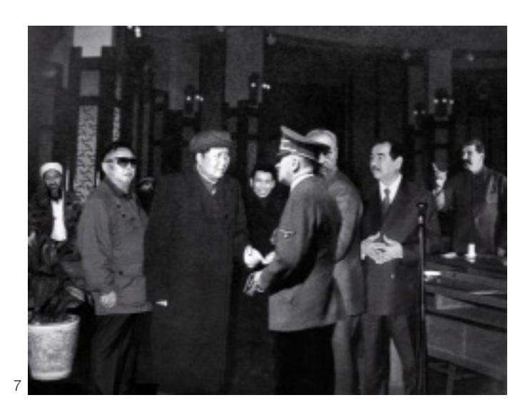
Can you identify all the infamous people in this manipulated image titled, The Interview by the Gao Brothers?

The Chinese government has increasingly become more tolerant of the themes and expressions of the work of contemporary artists, for example nudity once forbidden is more acceptable. Although artists are increasingly free to deal with social and political topics, and parodying the Cultural Revolution is a frequent subject, art that explicitly criticizes Chinese leaders or traditional symbols of China are still out of bounds