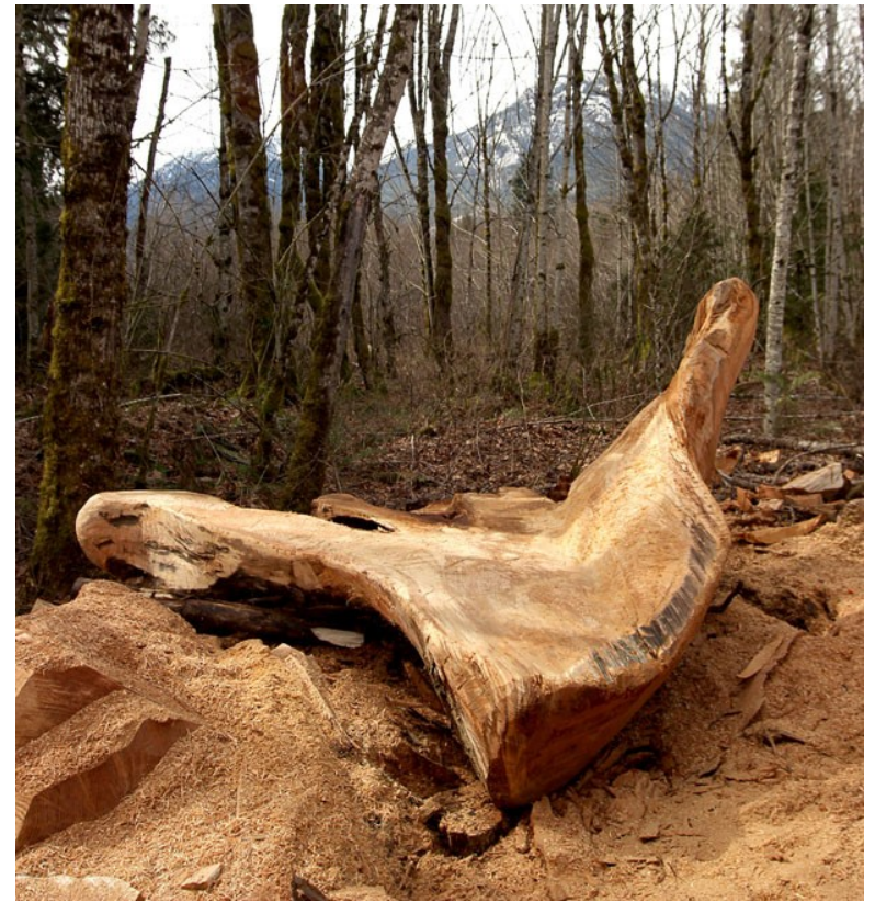
One of the almost finished parts