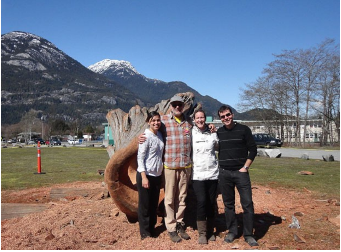
The sculptor and some Brazilians living in Vancouver