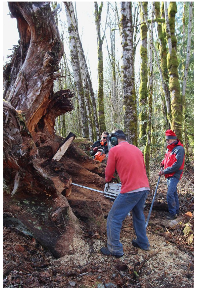
One of woods chosen by the artist was the fir