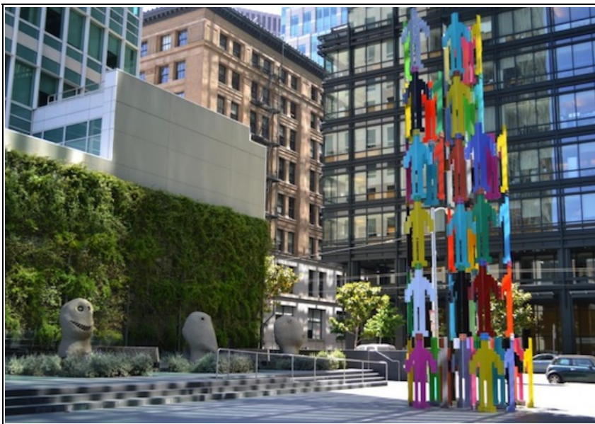
A similar Borofsky sculpture in a different context.

The meaning is hard to miss. In the sculptor's own words, the artwork represents "humanity connecting to humanity," across all racial and ethnic lines and other divisions. The figures are designed to look slightly "pixelated" (with rough, square edges), which adds to the symbolism. We all share photos with one another on computers and these photos – wherever in the world they come from – are all composed of the same underlying unit, the pixel.