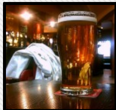
PINT CONTROVERSY SPILLS OVER IN VANCOUVER