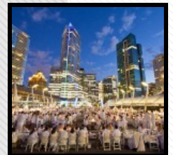
DINE AL FRESCO WITH 3200 FRIENDS: DINER EN BLA...