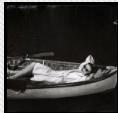
FILM NOIR SERIES AT CINEMATHEQUE