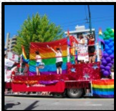
PRIDE WEEK ROUND-UP