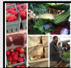
FRESH FROM THE MARKET AT CAMPAGNOLO