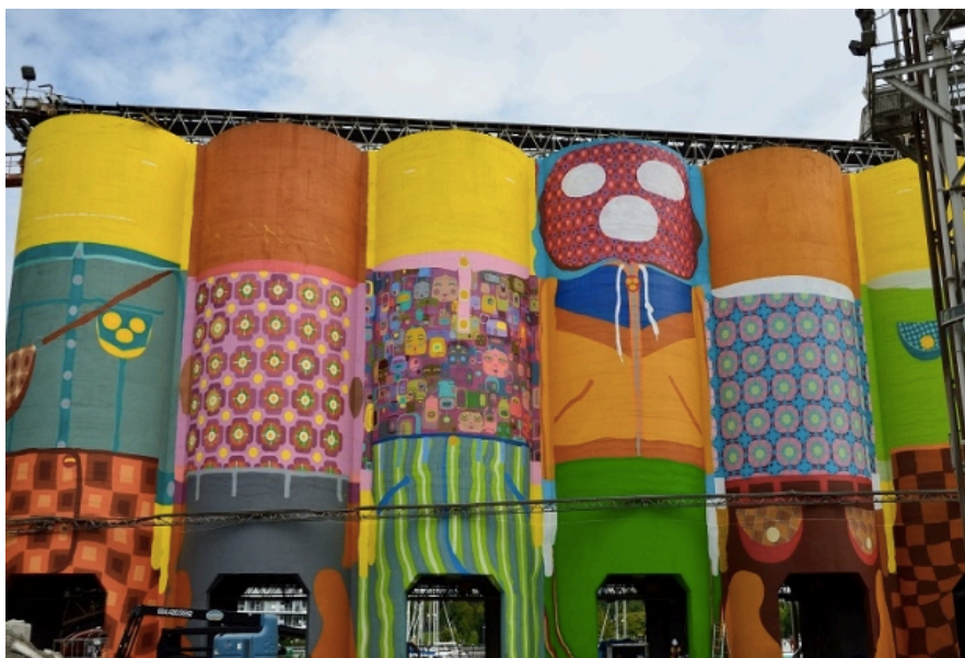
Brazilian artists OSGEMEOS are creating a huge mural on Granville Island's silos as part of the 2014 – 2016 Vancouver Biennale artistic exhibition.

CBC News Posted: Aug 26, 2014 5:24 PM PT | Last Updated: Aug 28, 2014 6:54 AM PT