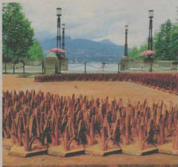
F Grass by Ai weiwei.