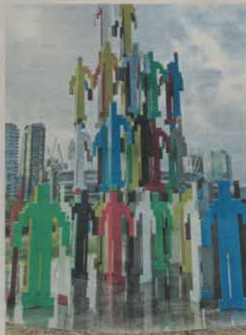
Human Structures Vancouver Jonathon Borofsky.