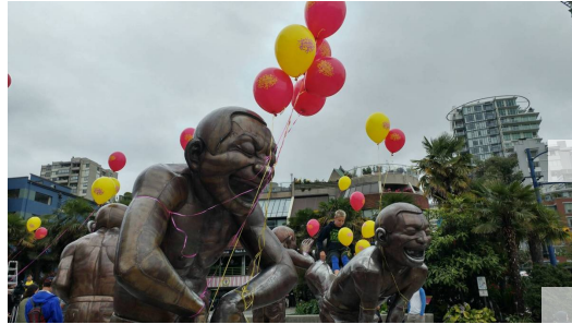
Thursday was Vancouver's day of laughter at Morton Park, home of the iconic A-maze-ing Laughter sculpture by Yue Minjun.