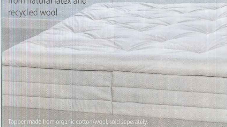
Topper made from organic cotton/wool, sold separately.

Quality crafted in Vancouver, Canada from natural latex and recycled wool