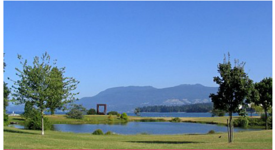
#4 - VANIER PARK AND THE CACV

Sometimes called “The Giant Paper Clip,” this sculpture acts as a great frame for taking photos of English Bay and the Burrard Inlet.