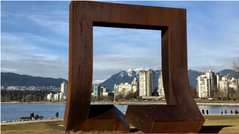
#3 - GATE TO THE NORTHWEST PASSAGE - ALAN CHUNG HUNG

Gate to the Northwest Passage Alan Chung Hung 1980