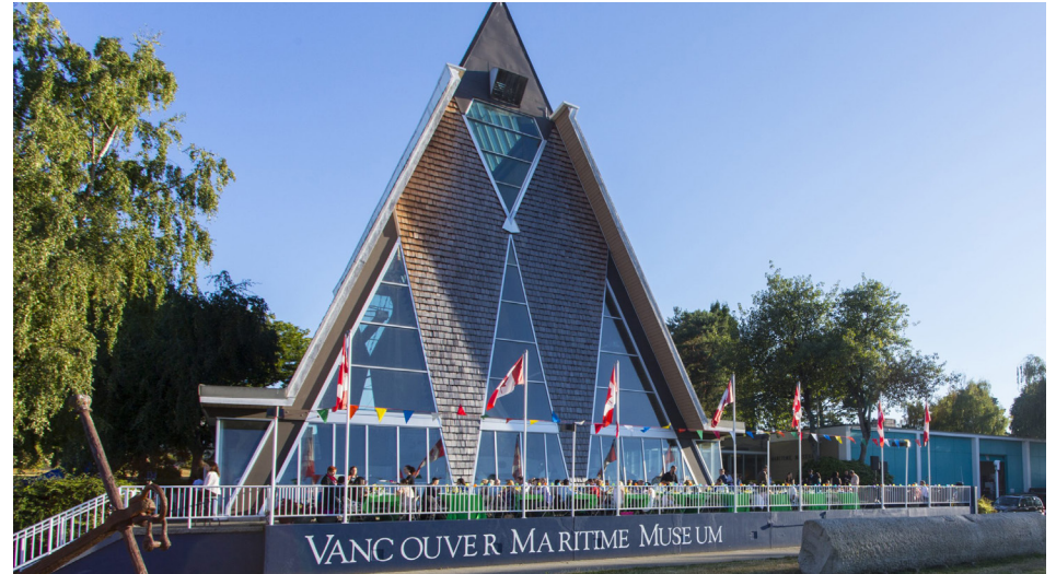
#2 - VANCOUVER MARITIME MUSEUM

Photo Challenge: Take a couple of pics of your favourite English and French phrases and tag us with #VanBiennale.