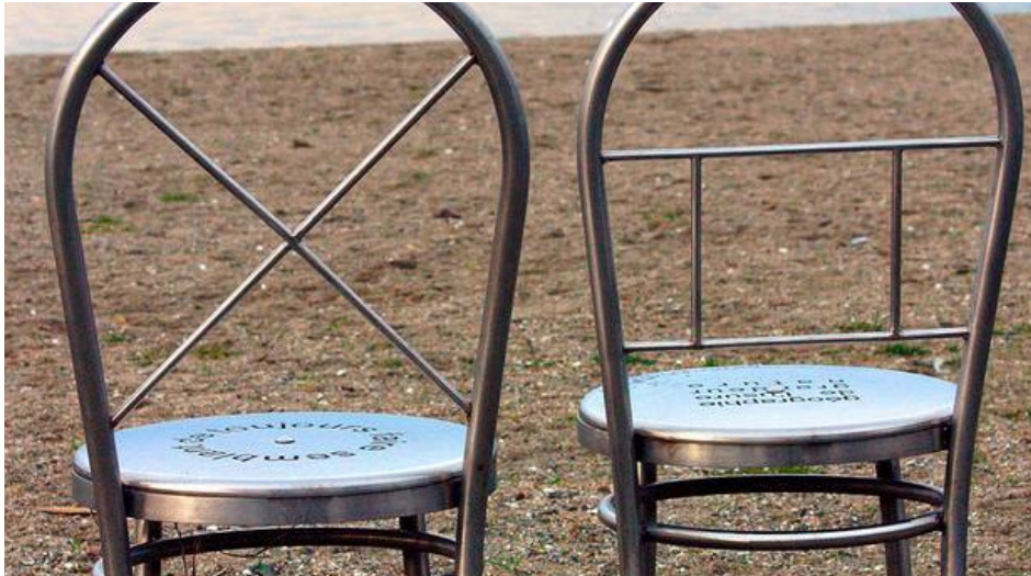
#1 - ECHOES - MICHEL GOULET