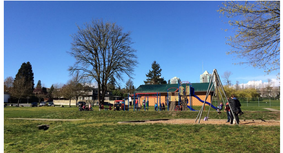
#8 - MACLEAN PARK

Sit in the shade and enjoy some people watching at MacLean Park! A Strathcona favourite for kids, grown-ups, and dogs, this park features a spray park, a grassy field lined with trees, and a baseball diamond. During the summer months, there are frequently food trucks and carts at the park and there are several cafes nearby (Wilder Snail is a Vancouver Biennale staff favourite).