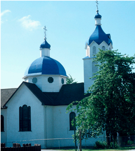
#7 - HOLY TRINITY CHURCH + RAYMUR-CAMPBELL HOUSING

The Holy Trinity Orthodox Church was built between 1938 and 1940. The location was selected because Strathcona was home to many Russian immigrants, but attendees were also Serbians, Greeks, and Canadians.