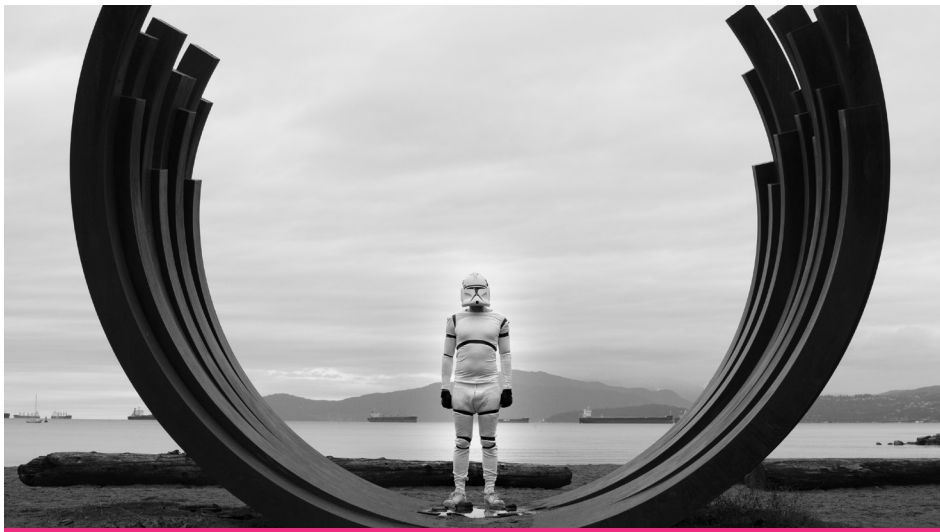
#7 - ARC 217.5 x 13 - BERNAR VENET