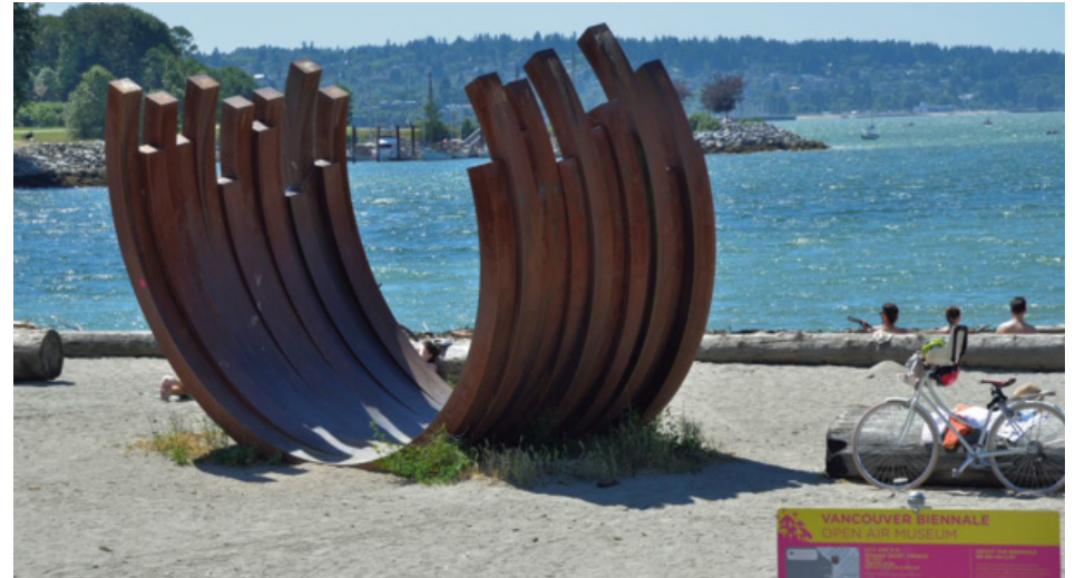
#8 - 217.5 ARC X 13 | Bernar Venet